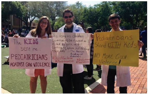
AAP District X Section on Pediatric Trainees